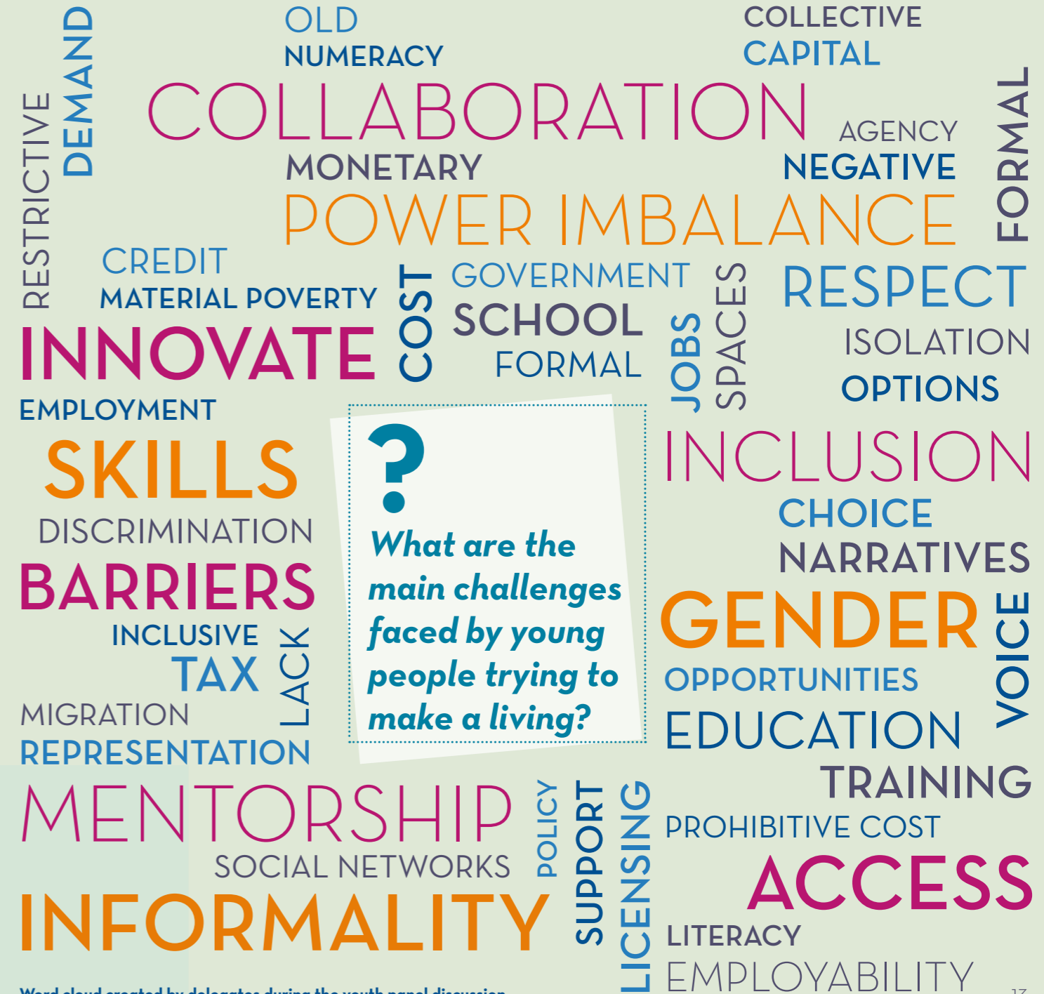
Word cloud created by delegates during the youth panel discussion.